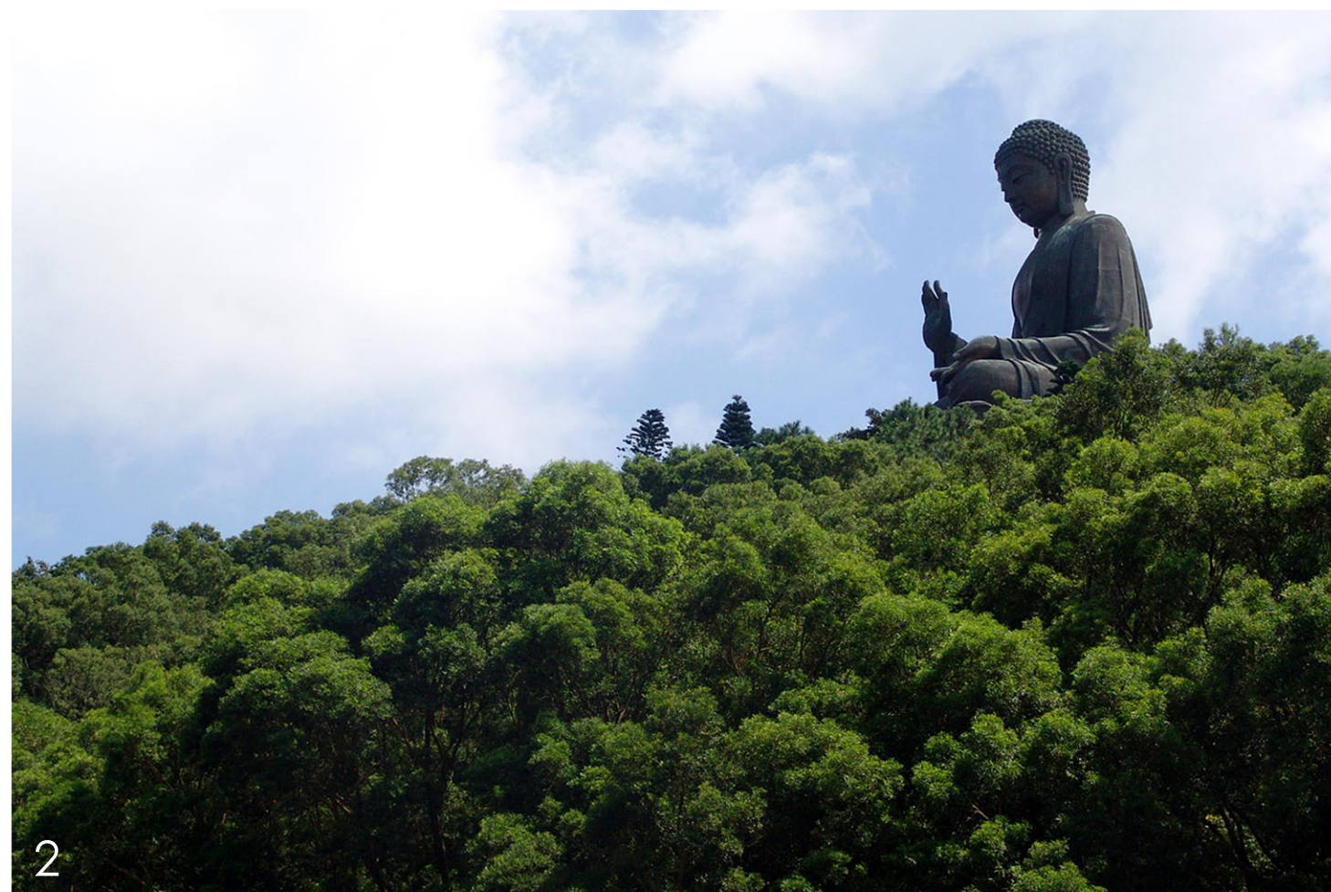
1. Bielany Monastery, 1604. 2. Big Buddha HongKong, 1990.