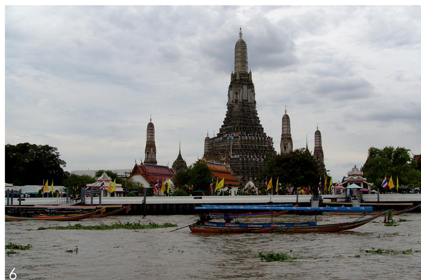
5. Chiesa del Santissimo Redentore, Wenecja 1576 - 1592. 6. Wat Arun /Temple of Dawn/, Bangkok, 1350 – 1767.