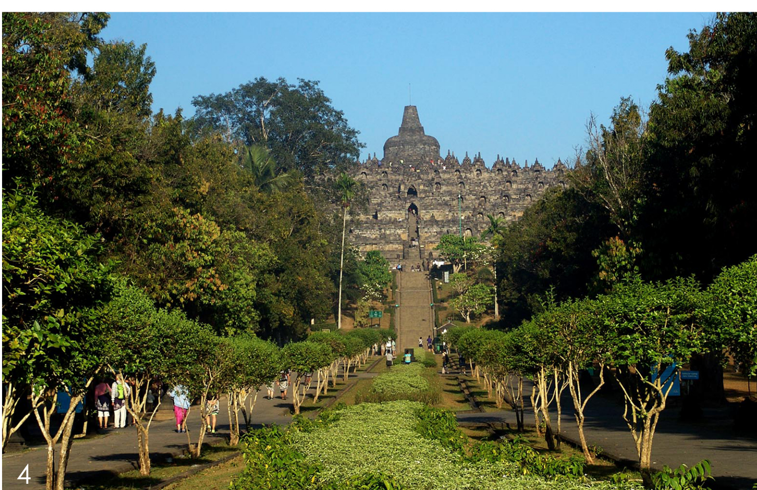
3. St. Peter Basilica, Rome, St.Peter Square 1656 – 67; Via della Conciliazione 1936 - 50, 4. The Borobudur Temple, Jawa, between 750 – 850