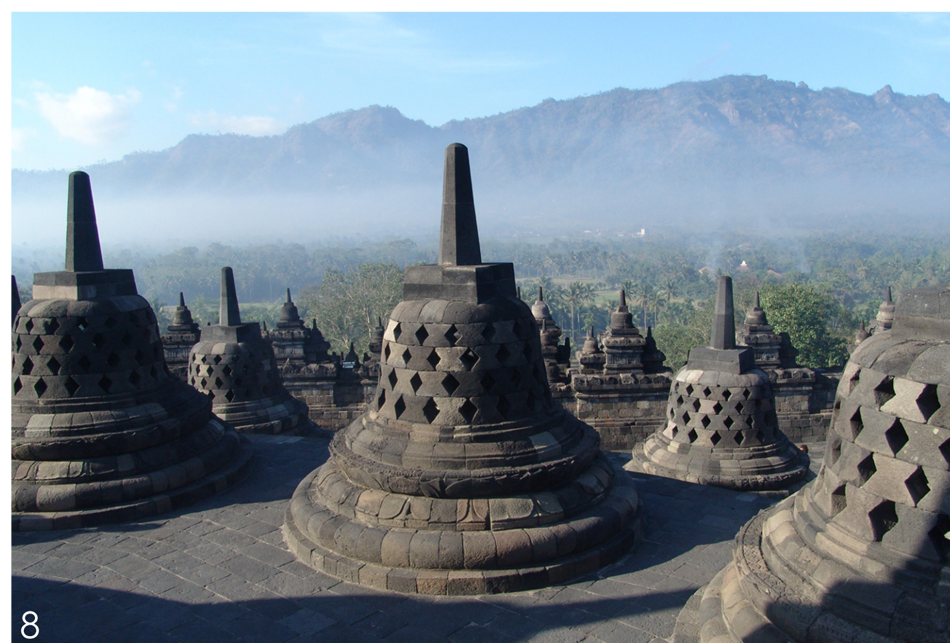
7. St John's Co-Cathedral 1572 – 77, interior: 17th century, La Valetta, Malta. Fot.: Agnieszka Matusik 8. The Borobudur, space for praying. Fot.: Agnieszka Matusik