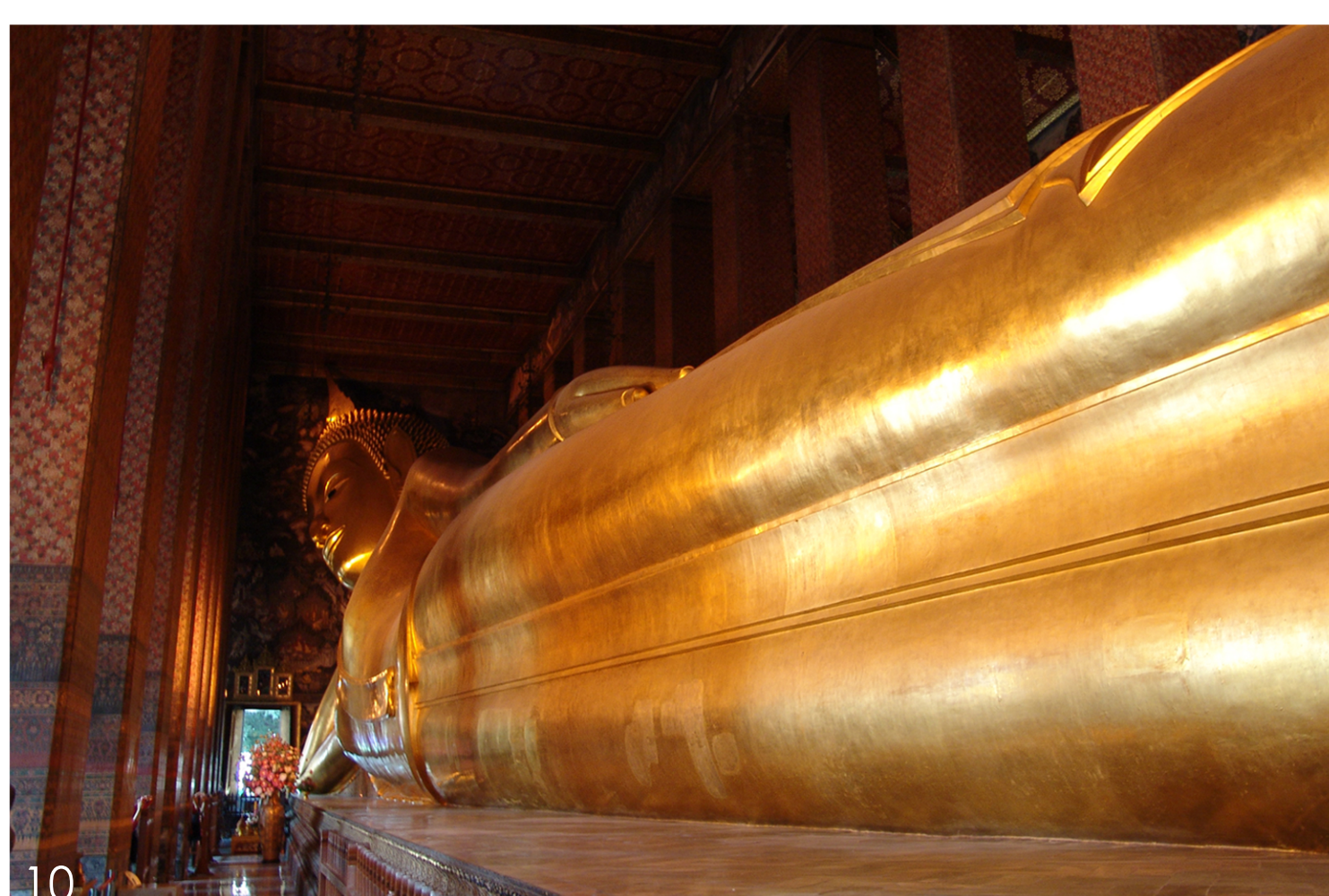
9. Baptistery, Florence XI – XIII century Fot.: Agnieszka Matusik 10. Wat Traimit, Chinatown, Bangkok. Fot.: Agnieszka Matusik